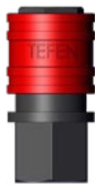
Threaded Quick Connect 22080004000