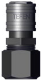
Gray Quick Connect 22080004161