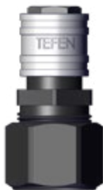
White Quick Connect 22080004131